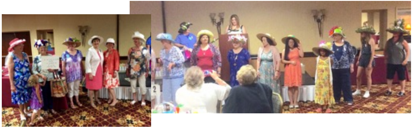
A Fine Array of Hats