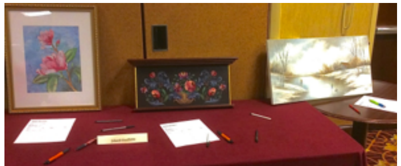
Luncheon Silent Auction